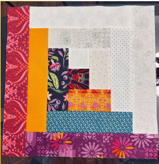
January 2025 – Log cabin