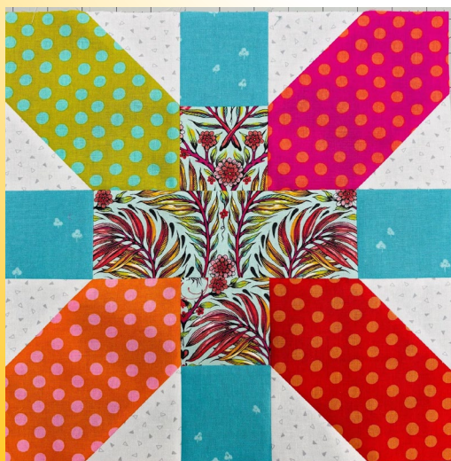
May 2025 – X and Plus