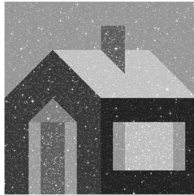
HOUSE SIX CONSTRUCTION