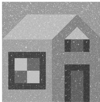
HOUSE FIVE CONSTRUCTION