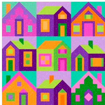
Houses 1 through 9