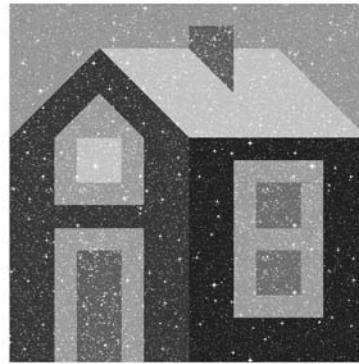
HOUSE FOUR CONSTRUCTION