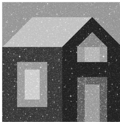
HOUSE TWO CONSTRUCTION