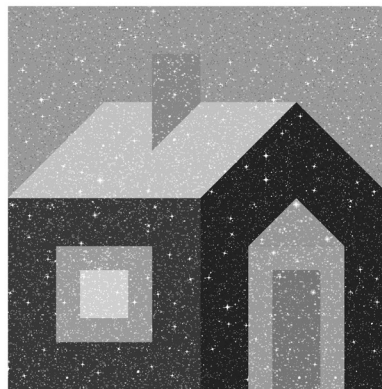
HOUSE EIGHT CONSTRUCTION