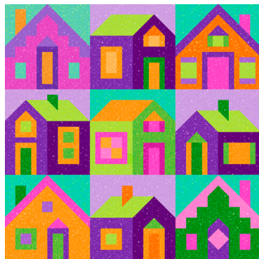
Houses 1 through 9