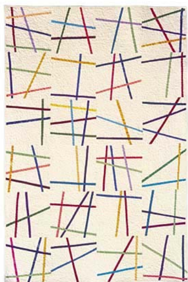
Pick Up Sticks