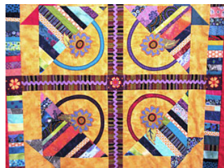
Bodacious Baskets

Brownstone Quilter's Guild has opened up their workshops to us, and ours will be open to their members. Go to the Members Only section of our website for a link to Brownstone's website and info.